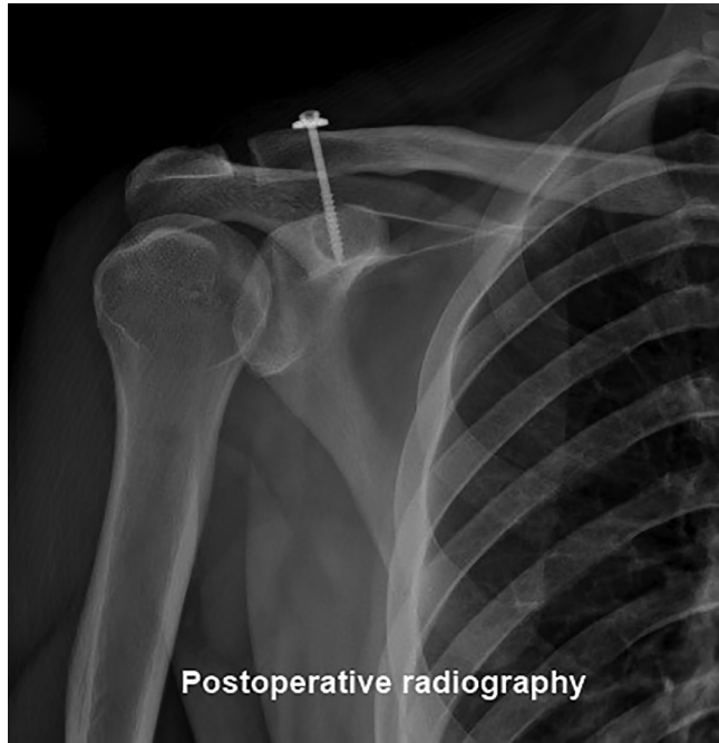
FIGURE 1. Bosworth technique radiography.

clavicle were entered with a parallel incision. After reduction of the AC joint, the clavicle and coracoid were drilled with a 3.2 mm drill. Only the superior cortex of the clavicle was hollowed with a 4.5 mm drill. Fixation was applied with one semi-cannulated spongeous screw (malleolar screw) of appropriate size and a washer (Fig. 1). In 3 patients, as there was a torn or subluxated disc which was preventing reduction of the AC joint, the disc was excised by extending the incision. It was not applied the CC ligament repair in any patient.