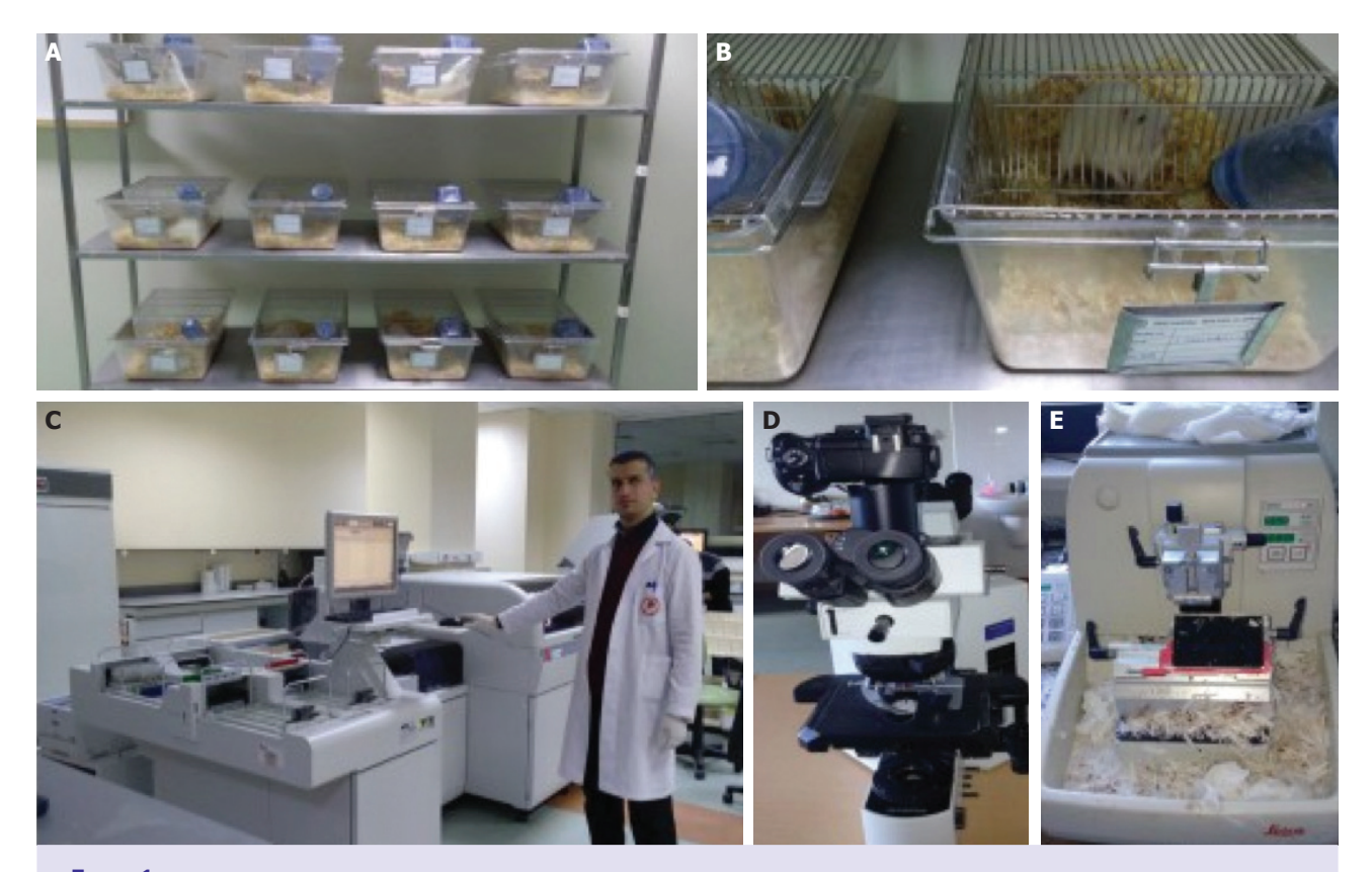
FIGURE 1 . Animal experiment, total antioxidant status, total oxidant status, and pathological analyses. (A) Housing of the experimental animals. (B) Each rat was kept individually in a standard cage. (C) The auto-analyzer used for oxidantantioxidant analyses (AU5800; Beckman Coulter, Inc., Brea, CA, USA) and researcher. (D) The optical microscope and integrated camera system used in the histopathological analysis (BX51; Olympus Corp., Tokyo, Japan). (E) The microtome device used in the histopathological analysis (RM 2245; Leica Biosystems Nussloch GmbH, Wetzlar, Germany).

OSI = TOS/TAS. The principle of TAS measurement is that antioxidants in the sample reduce the dark blue-green colored 2-2'-Azino-bis (3-ethylbenzthiazoline-6-sulfonic acid) (ABTS) radical to a colorless, reduced form of ABTS. The change of absorbance at 660 nm is related to the total antioxidant level of the sample. The assay is calibrated with a stable antioxidant standard solution known as Trolox Equivalent, which is similar to vitamin E [29]. The principle of TOS measurement is that oxidants present in the sample oxidize the ferrous ion-chelator complex into ferric ion. The oxidation reaction is prolonged by enhancer molecules, which are abundantly present in the reaction medium. The ferric ion provides a colored complex with chromogen in an acidic medium. The color intensity, which can be measured spectrophotometrically, is related to the total amount of oxidant molecules present in