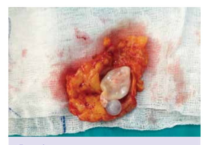
FIGURE 2. Hydatid cyst with its germinative membrane.

ous hydatid cyst is important because of the risks of anaphylaxis or recurrences due to spillage. Radiological imaging modalities as US, CT and MRI are very useful for the diagnosis, determination of the size, type and localization of the cyst. We performed MRI and CT to confirm the diagnosis of hydatid cyst and to demonstrate relationship of cyst to adjacent organs. It is also helpful for the search of other organs. Daughter cysts, germinative membrane, calcification and thick cyst wall are specific radiological properties for hydatid cyst. Serological studies are the most reliable adjunct to imaging tests in confirming the diagnosis of echinococcosis. Although positive serological tests are helpful in the establishment of diagnosis, their absence does not exclude the presence of echinococcosis. They are rarely positive in extra-hepatic, and extra-pulmonary localizations [3]. In our patient the hydatid serology was negative.